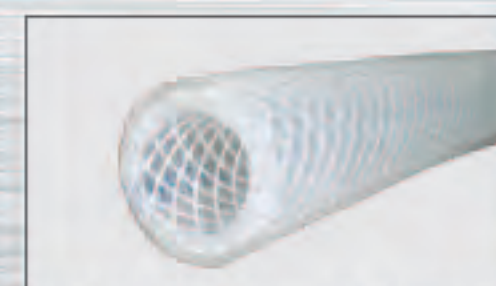
Silicon hose (up to φ34)

Suitable for cutting plumbing materials such as bridge polyethylene tube and CD tube especially for water supply or hot water supply construction.