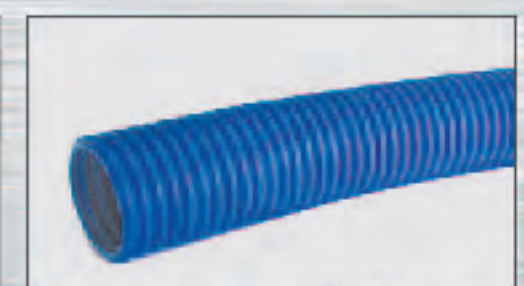
CD tube (up to φ34)