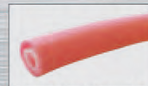
Bridge polyethylene tube (up to φ34)