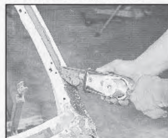
Paint removal work on flat surfaces.(MB20S)