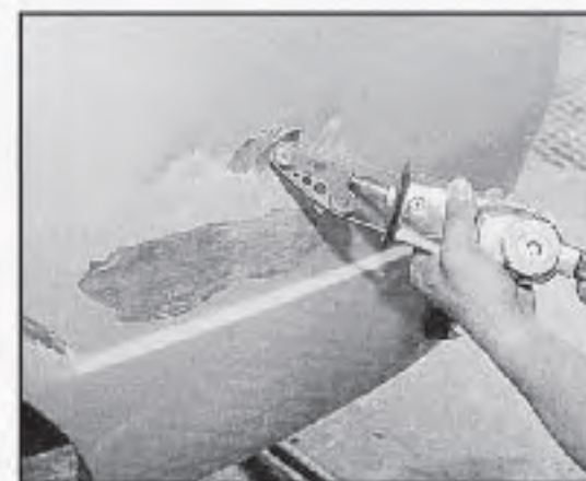
Paint removal work on concave surfaces